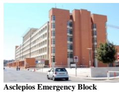
Asclepius Emergency Block