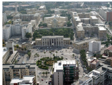
The Policlinico Hospital